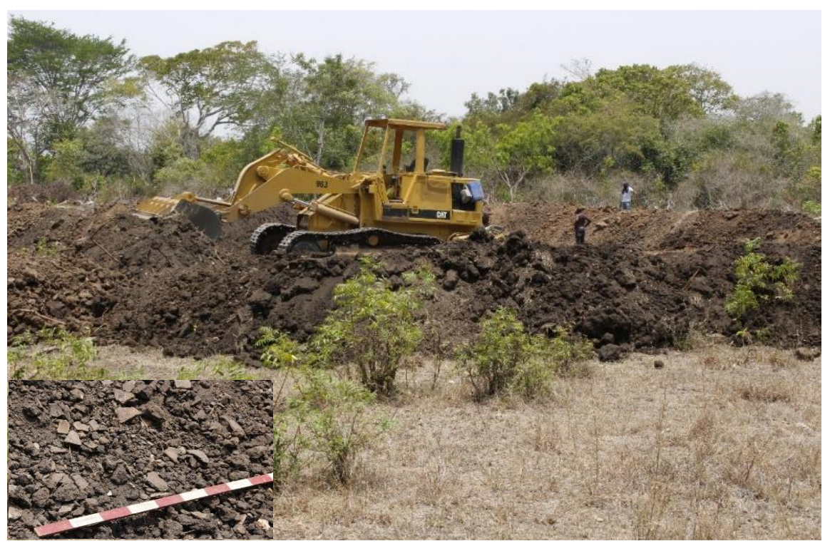
Figure 1 : A section view of an early-second millennium archaeological site of Kimu in Pangani Bay massively destroyed by the construction of fish ponds.

The heritage register has been described as a national database and an essential planning tool for managing, protecting and conserving the country's heritage resources.<sup>365</sup> It fulfils these roles by entering relevant information on the heritage resources, such as type, location, size, significance, preservation status, legal ownership and strategies for managing them.<sup>366</sup> In Tanzania, all cultural heritage resources listed in the national