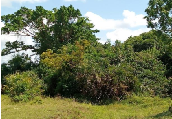
Figure 3 : A 'Defensive Wall' (left) which is a national monument protected under the Antiquities Law, and a nearby 'sacred grove' (right) protected by the local community as their heritage.

Similarly, Bwasiri<sup>400</sup> argues that even the decision by the colonial and post-colonial governments to proclaim and register the rock painting sites in Kondoa district, Dodoma region, was not due to their cultural significance to neighbouring local communities, because they were eventually prevented from accessing these sites for ritual activities after they were proclaimed, triggering serious antagonism between them and the site managers.<sup>401</sup> The ruins at Kaole in Bagamoyo<sup>402</sup> and Kunduchi in Dar es Salaam<sup>403</sup> were dealt with in the same way.